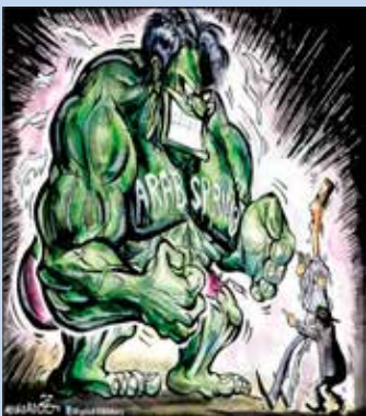
Arab News, 26/3/2012